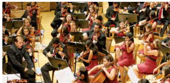
Youth Orchestra of Caracas

Since 2011 the currently third generation of the orchestras founded by El Sistema, the Youth Orchestra of Caracas, has baffled not only European audiences with a musical passion that – despite large numbers of players – sets to work with a perfection well above the norm, even among professional orchestras. Fresh, dynamic and versatile – those are attributes often used to describe the Youth Orchestra of Caracas (YOC) by enthusiastic critics. The high-powered orchestra brings together 180 musicians aged 14 to 22, all of them trained under the aegis of José Antonio Abreu, Ulyses Ascanio and Gustavo Dudamel – the former orchestra directors – and their current music director, Dietrich Paredes.