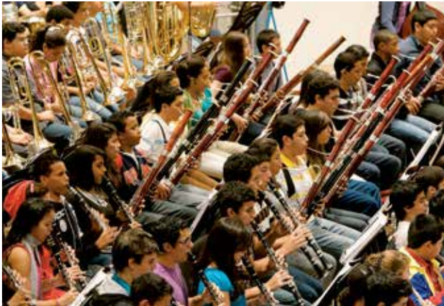
National Children's Symphony Orchestra of Venezuela

What began with a handful of musicians in 1975 became Acción Social por la Música ("Social Action through Music") and today, 38 years later, has become an enormous movement with a dense network – El Sistema – of children's, youth and adult orchestras, choruses and music centres. In the cities and rural communities of Venezuela, there are 1550 music groups, 24 state-sponsored orchestras and 286 music schools called núcleos , deliberately built in close proximity to the poorer quarters. After all, of the almost 400,000 children and teenagers currently receiving free music lessons from El Sistema, about 75% live below the poverty line.