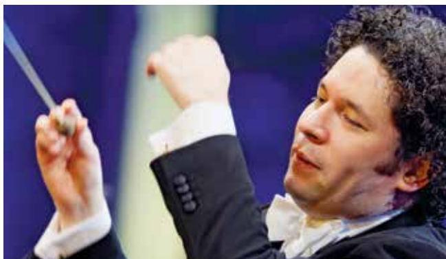
Gustavo Dudamel