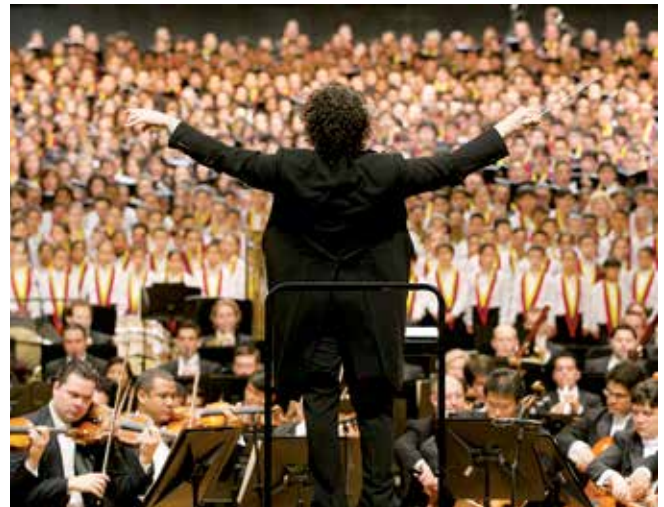
Mahler VIII – Gustavo Dudamel with the Simón Bolívar Symphony Orchestra and Los Angeles Philharmonic, Caracas 2012