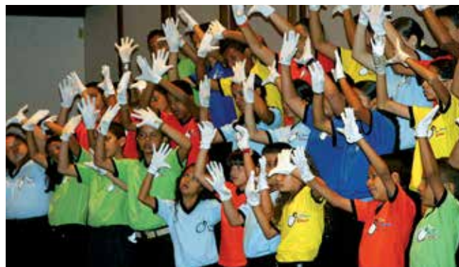
White Hands Choir

August 8 / 9 — 3:00 pm Stiftung Mozarteum / Großer Saal