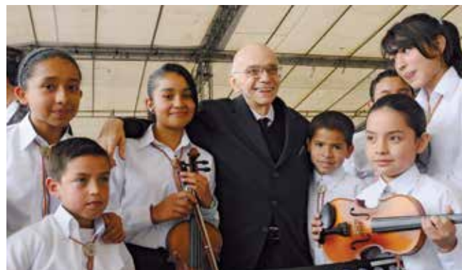
José Antonio Abreu

For the children we work with, music is practically the only path towards a dignified social existence. Poverty means loneliness, sadness, anonymity. An orchestra means joy, motivation, teamwork, striving for success. José Antonio Abreu