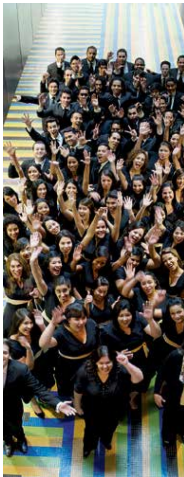
Simón Bolívar Youth Choir

The summertime performances of Mozart's Missa in C Minor KV 427 at the Collegiate Church of St Peter are deeply rooted in the cultural life of the city of Salzburg, having a long tradition: since 1927, the Missa has been performed by the Mozarteum Foundation Salzburg in cooperation with the Salzburg Festival. The tradition was initiated by Bernhard Paumgartner, who also conducted the greatest number of performances (a total of 31). He was followed by many renowned conductors, for example James Levine, Hans Graf, Nikolaus Harnoncourt, Leopold Hager, John Eliot Gardiner, Ivor Bolton, William Christie, Marc Minkowski or Yannick Nézet-Séguin. Apart from (post-) wartime interruptions in 1940 and from 1942 to 1949, the Missa in C Minor has been a fixed part of the Salzburg Festival programme. During the first years, the instrumental ensemble was composed of members of the Vienna Philharmonic and the Mozarteum Orchestra (or rather its predecessor); from 1935 to 1991 the Mozarteum Orchestra Salzburg provided the instrumental foundation. Since then, various orchestras have performed for the event, most frequently the Camerata Salzburg and the Mozarteum Orchestra Salzburg.