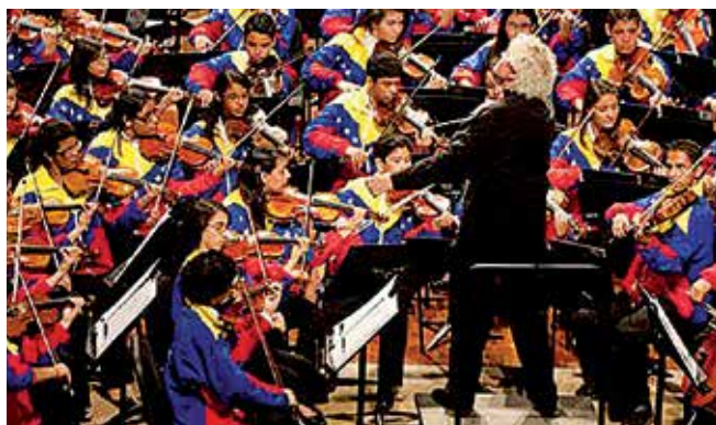
Simon Rattle mit dem National Children's Symphony Orchestra of Venezuela

When the National Children's Symphony Orchestra was initiated in 2010 by José Antonio Abreu, Simon Rattle took the podium himself and conducted the first-ever concert of the new Venezuelan children's orchestra at the Aula Magna of the University of Caracas. 377 children between the ages of eight and 13 played works by Gershwin, Fauré and Ginastera with great passion and musical seriousness. The fact that this young ensemble also dared to play Mahler's Symphony No 1, however, astonished all those present – and was rewarded with standing ovations. This summer, the National Children's Symphony Orchestra embarks upon its first tour abroad, following the invitation of the Salzburg Festival – but “only” with about 250 members. And once again, it will be Simon Rattle who conducts the children's orchestra in its international debut. However, some of the children will be different from three years ago,