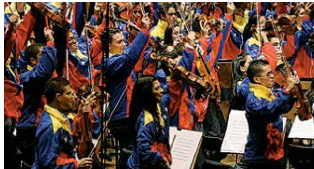
Teresa Carreño Youth Orchestra

The Teresa Carreño Youth Orchestra of Venezuela (TCYO), named after the Venezuelan pianist Teresa Carreño, world-famous in her day, is among the most important projects to be launched by the orchestra programme of the El Sistema music initiative. The orchestra, founded in 2007, brings together about 160 musicians aged 14 to 25, all of them educated to the highest artistic and technical level on their instruments. The TCYO performs regularly with renowned artists like Simon Rattle or Claudio Abbado, embarking upon its first European tour three years ago.