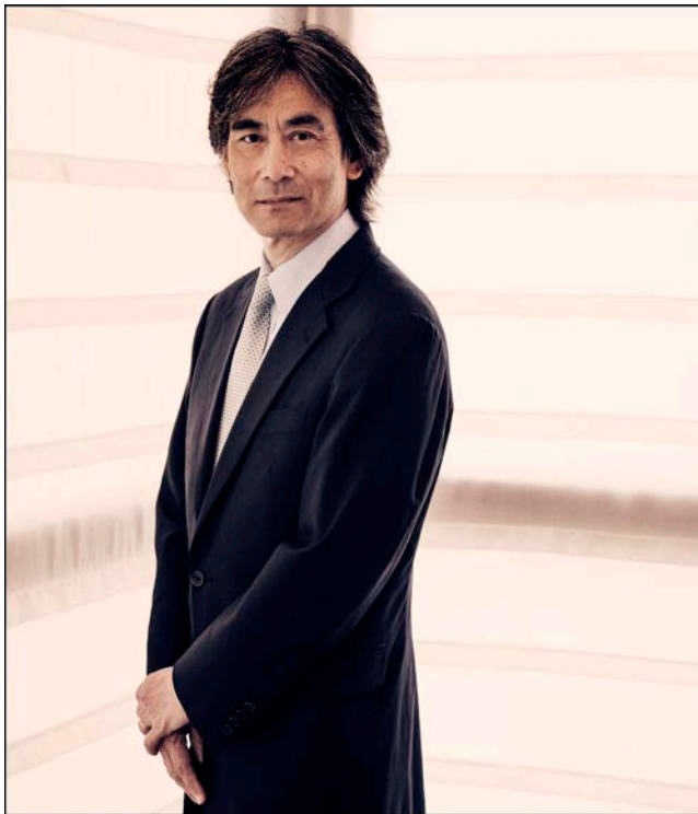
Kent Nagano